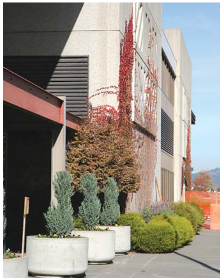
Another view of an old Agilent building that will be renovated as part of Sonoma Mountain Village.

Baker and Coddling decided to look at mixed-use projects because of their popularity in the county. It must have been fate because, not two months later, opportunity knocked in the form of Agilent Technologies auctioning off its 200-acre site in Rohnert Park. The site was perfect for Coddling Enterprises, which had been headquartered in Rohnert Park for more than 30 years; it’s within city limits and already had a great deal of infrastructure in place, including existing buildings, water and sewer systems and a train track. In addition, the location itself is beautiful—rural yet surrounded by residential homes and less than a mile away from Sonoma State University.