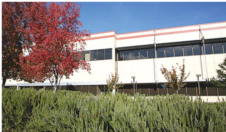
Coddling Enterprises will renovate the buildings on the old Agilent site, such as the one shown here, to create Sonoma Mountain Village.

The firm continuously developed until about 1995, at which point it focused exclusively on managing existing properties. Now, more than 10 years later, it’s returned to both developing and managing properties.