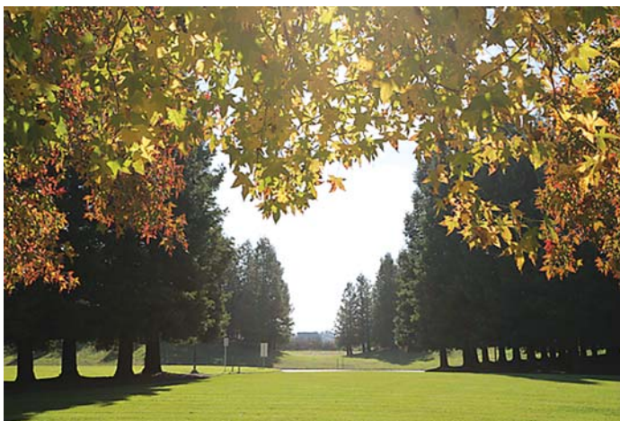
A view of Sonoma Mountain Village's landscape.